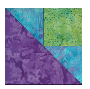
Make 24 – 6" Finished Shaded Four Patch Units