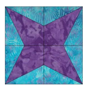
Make 8 - 6" blocks consisting of 4 - 3" finished Corner beams (32)