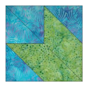
Make 16 – 6"Trimed Lemoyne Quarters (using strip sizes from 12" finished)