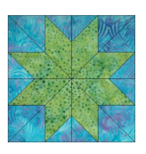
Make 1 – 12" finished Lemoyne Star