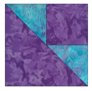
Make 12 – 6" Finished Shaded Four Patch Units