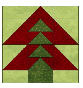
Make 8 – 12" Finished Blocks

Cutting mat, rotary cutter with a new blade, sewing machine in good working order, scissors, 6x24" & 6"x12" ruler thread, pins, pen Invisi-Grip recommended