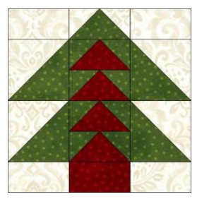
Make 7 – 12" Finished Blocks