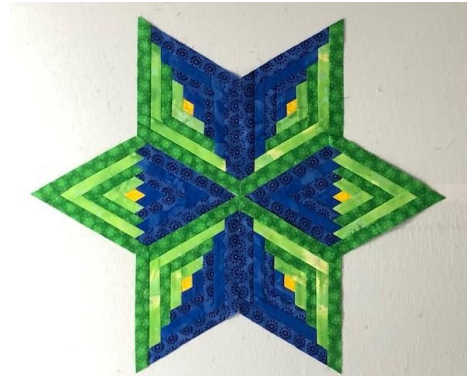
North/South & East/West