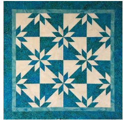
Hollow Cube 60